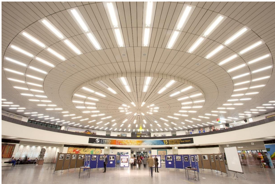
Photo of the C-Building hall

The Expert Consultation and related Meetings on Developing Strategies and Implementing Geospatial Solutions for the Sustainable Development Goals will be held in Conference Room 4 (CR4), C building, Vienna International Centre, Wagramer Strasse 5, 1220 Vienna.