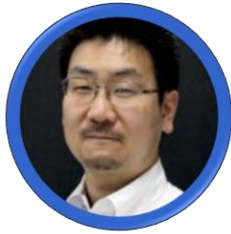
WG 1 GEODETIC REFERENCE FRAME