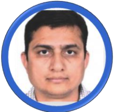
WG 4 IGIF