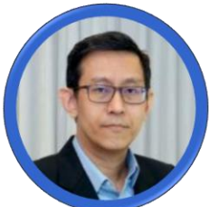
WG 2 CADASTRE AND LAND MANAGEMENT