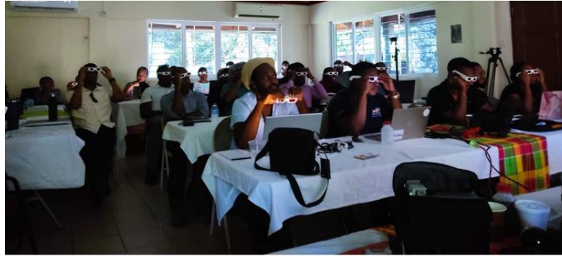
Drone Tasking Manager Training 2024