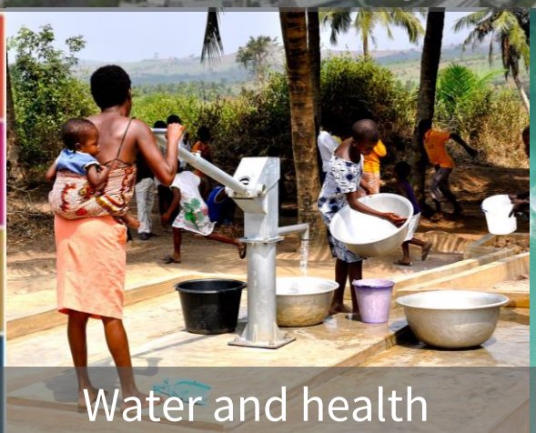
Water and health