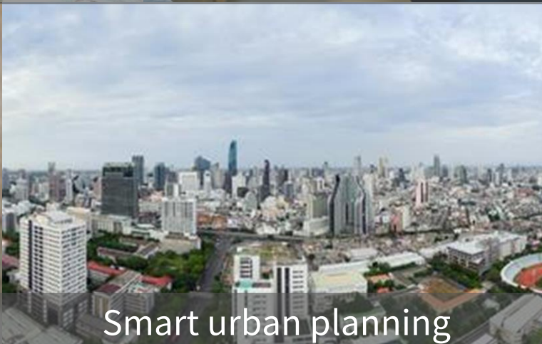
Smart urban planning