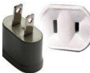
Type A: This socket has no alternative plugs

In México the power plugs and sockets are of type A and B. Check out the following pictures.