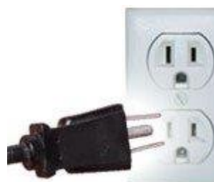
Type B: This socket also works with plug A