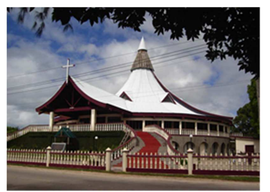
Basilica St. Anthony of Padua (Catholic)