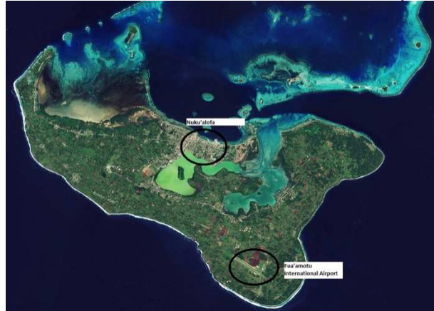
Main island, Tongatapu