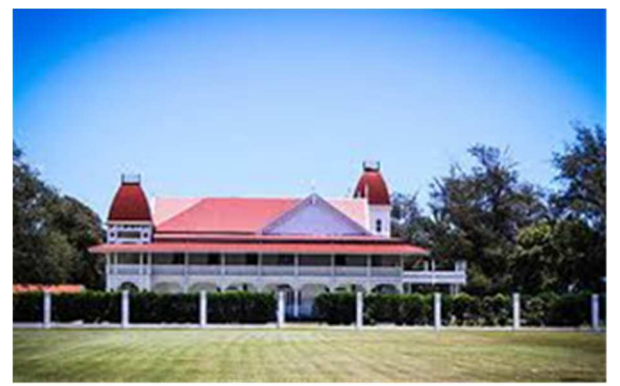
The Royal Palace