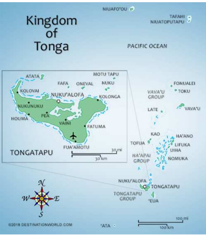
Map of Tonga