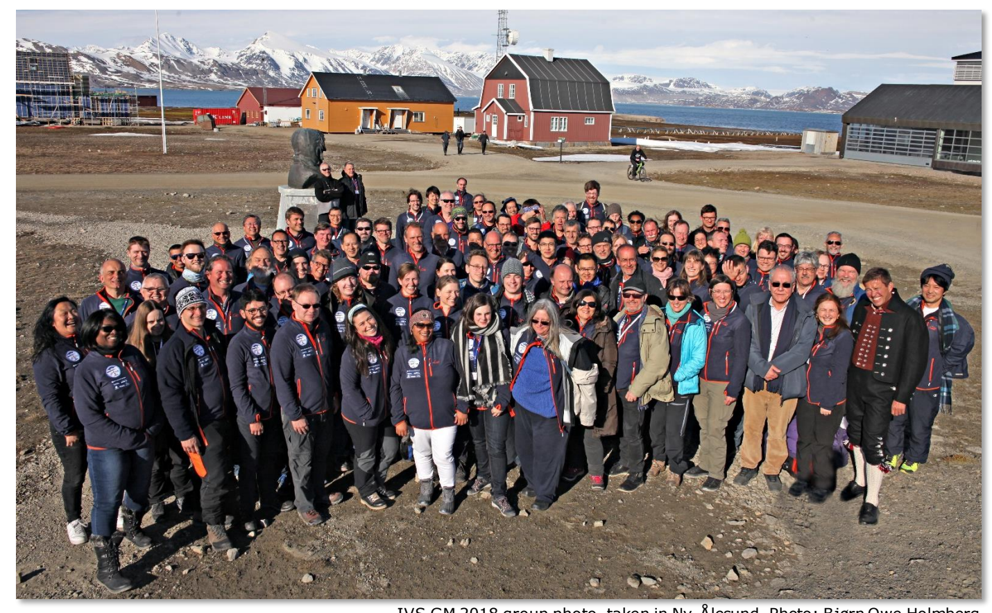
IVS GM 2018 group photo, taken in Ny-Ålesund, Photo: Bjørn Owe Holmberg