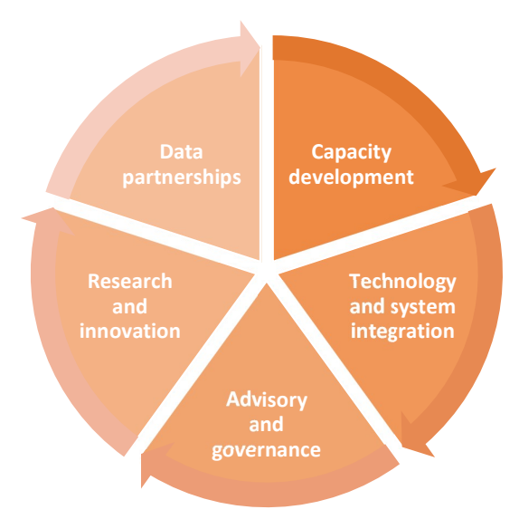
Figure 7.5: Areas of need with partnership potential