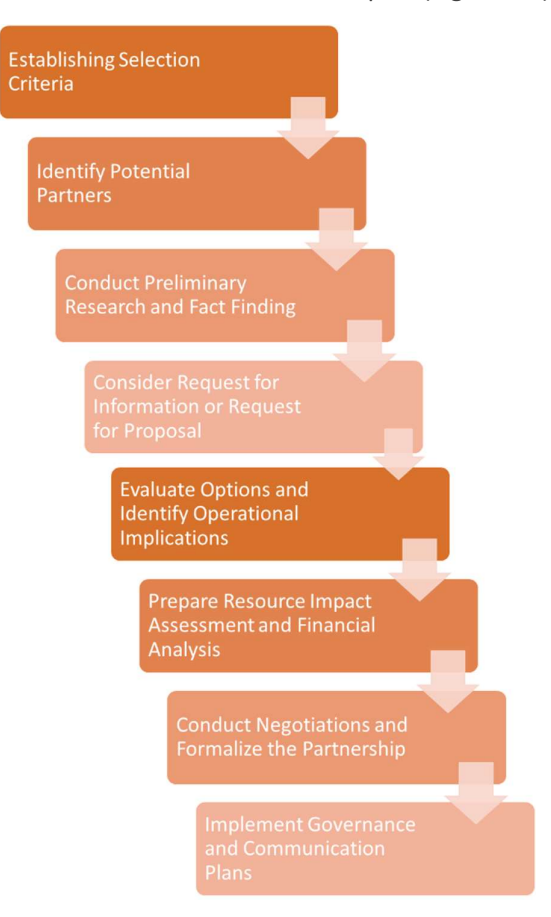
Figure 7.6: An example of a process for evaluating geospatial-related partnerships/collaborative ventures.

(7) conducting negotiations and formalizing the partnership; and (8) implementing governance and a communication plan (Figure 7.6).