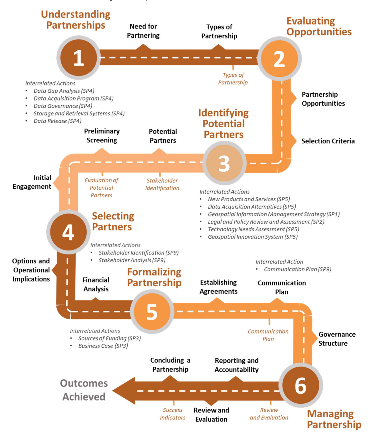
Figure 7.3: Partnerships includes several actions and tools designed to assist countries to create and sustain the value of geospatial information through a culture based on trusted partnerships and strategic alliances that recognize common needs and aspirations and national priorities. The actions are divided into six categories and reflect the order with which these actions are typically completed.

capability to strengthen nationally integrated geospatial information management, capacities and infrastructures.