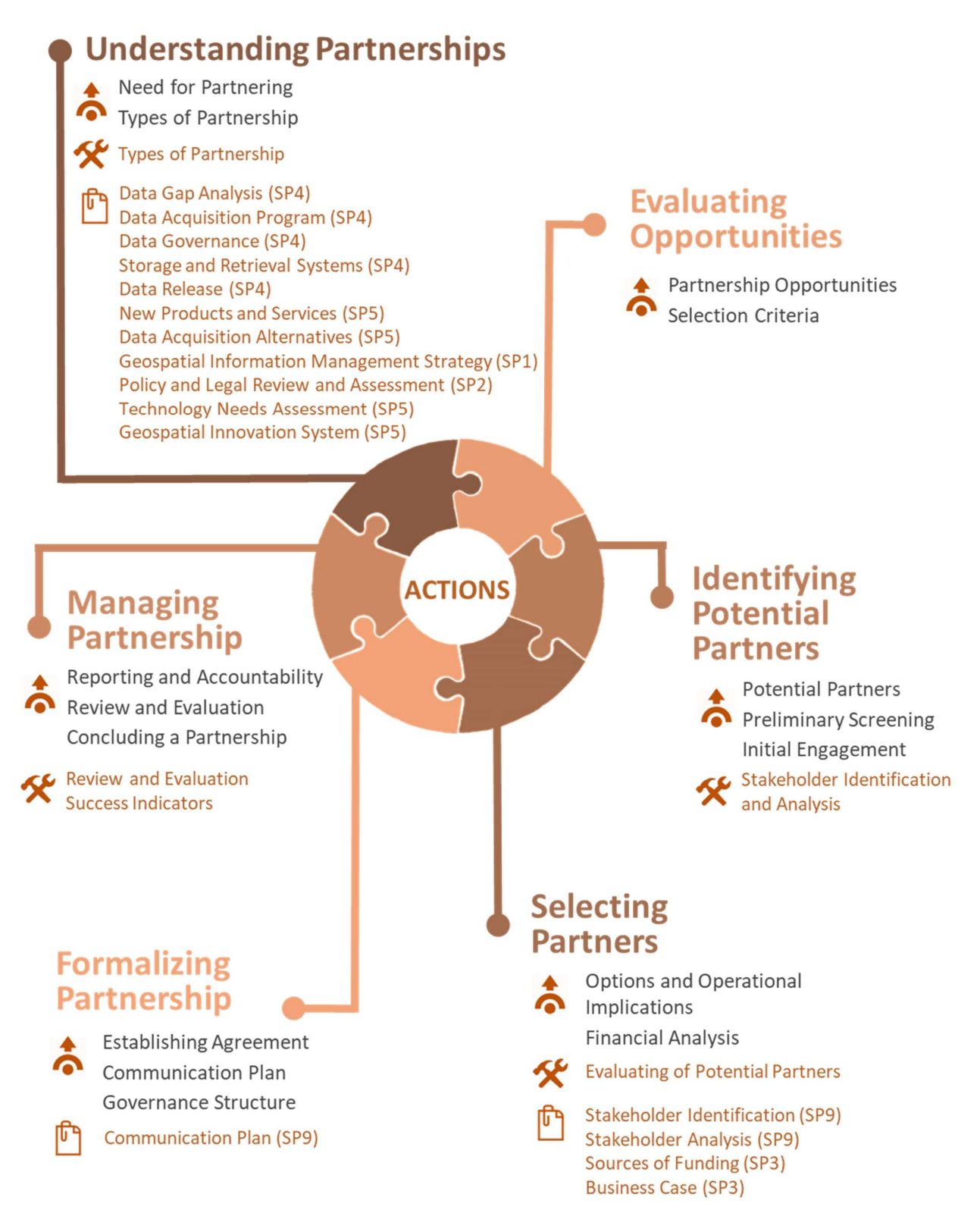
Figure 7.4: Partnerships includes several actions and tools designed to create and sustain the value of geospatial information through a culture based on trusted partnerships and strategic alliances that recognize common needs and aspirations and national priorities. The interrelated actions provide key linkages to other strategic pathway actions