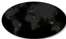
Sharemeister Geospatial Example