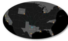
Sharemeister Geospatial Example