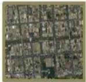
Plano de Ubicación en Manzana