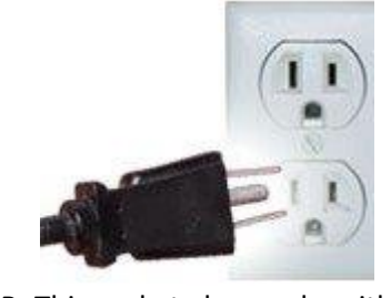
Type A: This socket has no alternative plugs